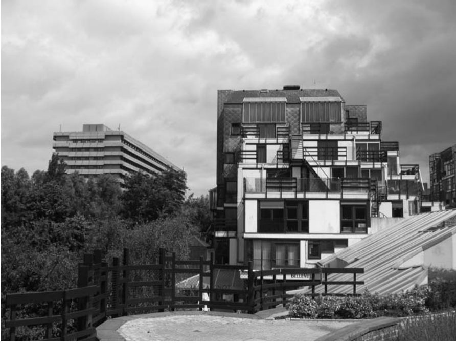
Figure 16.3 Kroll's work contrasted with other campus architecture of the period

an example. 60 He states: “The notion was that . . . ‘users’ and ‘inhabitants,’ as a group, would secure the services of someone competent, capable of speaking and communicating—in short an advocate—who would negotiate for them with political or financial institutions.” 61 In Lefebvre’s thinking, these attempts to speak for the users were bound to fail “because no one has the right to speak for those directly concerned here. The entitlement to do so, the concepts to do so, the language to do so are simply lacking. How would the discourse of such an expert differ from that of the architects, ‘developers’ or politicians?” 62 Although these practitioners were well intentioned, their efforts ultimately fell short because they did not give voice to the silent users, choosing instead to speak for them, interpreting their needs. 63