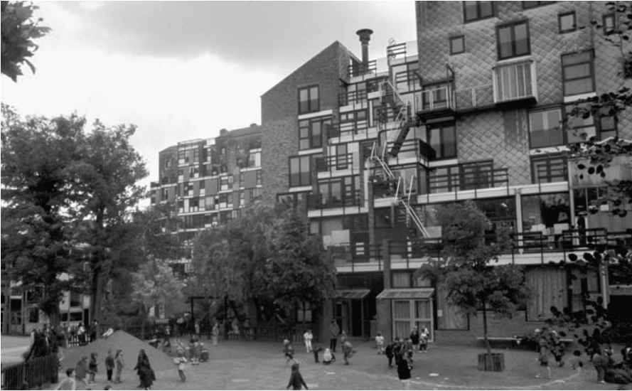
Figure 16.2 Student residence, L'Université Catholique de Louvain, Brussels

paternalistic order” of the pre-existing institution and its architecture with his team’s approach that moved toward “diversity, everyday culture, decolonization, the subjective, toward an image compatible with the idea of self-management, an urban texture with all its contradictions, its chance events, and its integration of activities” 56 (see Figure 16.3). He claims that this approach is political rather than aesthetic, and compares his work with the complexity of ecological systems. 57 While Lefebvre criticizes the focus on “things in space” (commodities) rather than a broader understanding of production of space, 58 Kroll suggests that his practice has “moved far from the traditional role of the architect as maker of isolated objects.” Instead, Kroll’s emphasis is on the “relationships between people in space that suits them . . . Construction finds its meaning only in the social relations that it supports.” 59